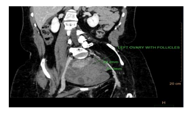
Figure 5: Non contrast CT abdomen coronal view of pelvis shows normal left ovary with follicles.