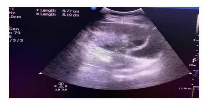
Figure 1: Ultrasonography of enlarged right ovary.

As it was not salvageable, the right ovary and tube were removed. Peritoneal lavage was given and port closure was done. Post operatively she was managed with IV fluids and GnRH antagonist.