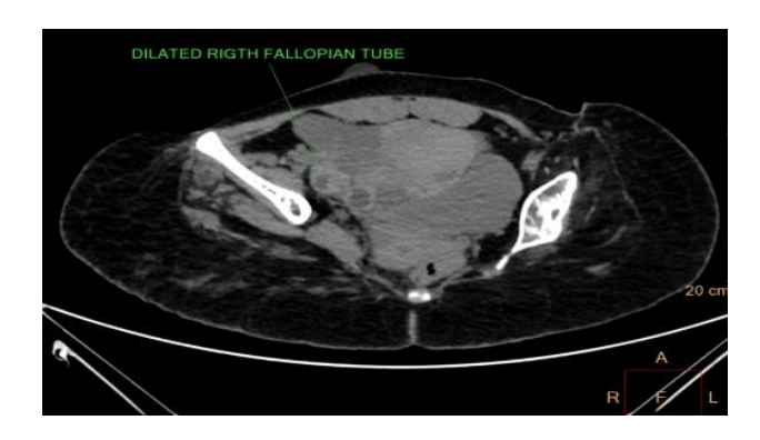
Figure 4: Non contrast CT abdomen of dilated fallopian tube.