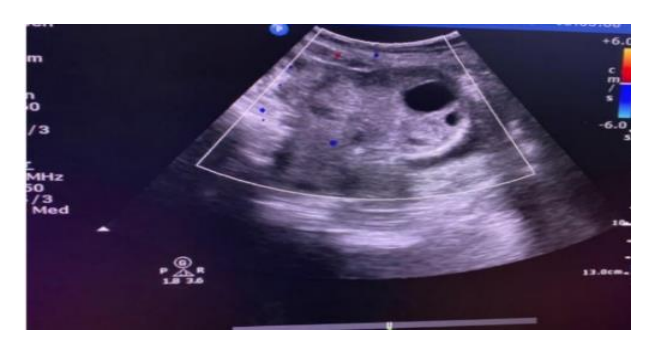
Figure 2: Ultrasonography of normal left ovary.