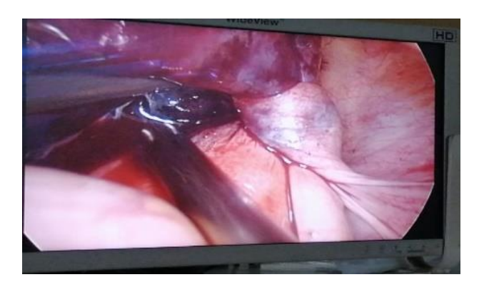
Figure 6: Twisted right tube and ovary.