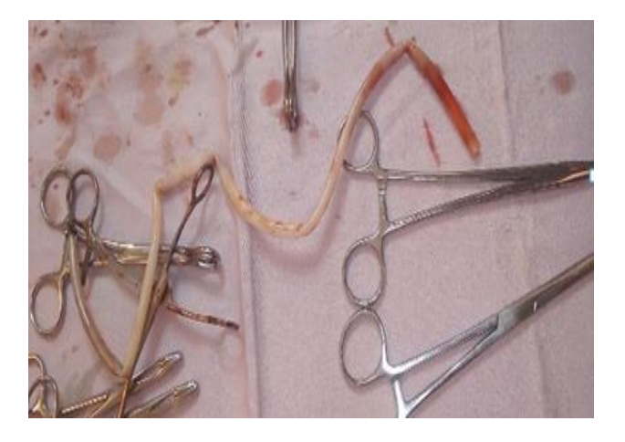
Figure 3: Retained instrument used for illegal abortion.

in contact with the uterus. Authors had not found a solution of uterine continuity. The plastic instrument was in contact with the uterine artery and the left ureter. A transverse low segmentary hysterotomy was performed followed by trans-placental podalic extraction in a clear amniotic fluid of a female baby, asphyxiated followed by hysterorrhaphy. Dissection of the left broad ligament followed by ablation of the plastic tube was performed after identification of the ureter (Figure 2).