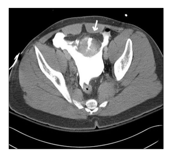
Figure 1: CT Cystogram showing intraperitoneal rupture.

4weeks showed no urinary leak and the suprapubic catheter was removed after 6 weeks. Postop period uneventful.