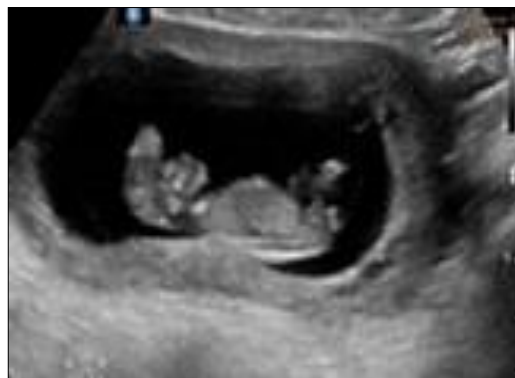
Figure 1: Anencephaly.

Congenital anomalies are responsible for a of 14.2% of perinatal mortality in India. 1 Advancement in imaging technology and increased expertise in field of fetal medicine has tremendously improved detection of fetal abnormalities. 2 Routine basic antenatal care includes 1 st trimester scan at 11-13+6 weeks scan and 2 nd trimester scan at standard time 18-22 weeks of gestation. Besides abnormal nuchal translucency and paranasal triangle, a range of CNS (Figure 1), CVS, GIT (Figure 2), GUT and skeletal abnormalities can be detected in 11-13+6 weeks scan. The clear benefit of early detection is relatively easier pregnancy termination if required. 3