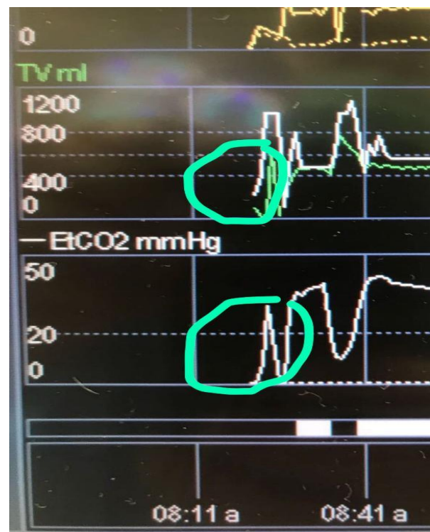
Figure 2: The sudden drop in ETCO 2 during the procedure.