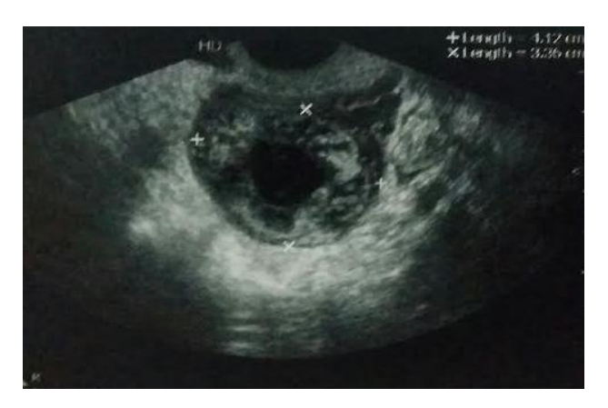
Figure 3: Ultrasound finding of rudimentary horn ectopic pregnancy.

Postoperative period was uneventful. Histopathology report of the evacuated products confirmed the diagnosis of pregnancy. Serial beta-HCG levels showed a falling trend and came to non-pregnant level after 6 weeks.