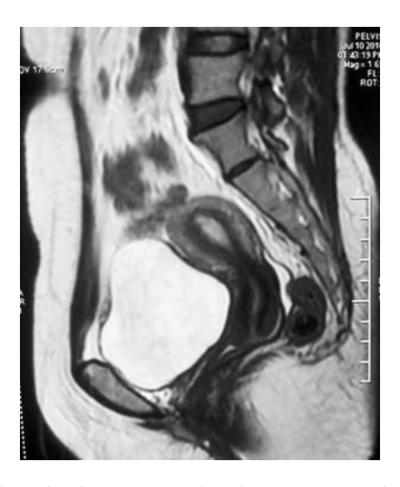
Figure 2: T2WI-MRI showing high transverse vaginal septum (arrow).