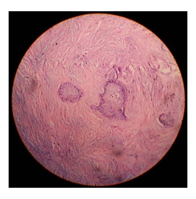
Figure 3: Section showed from left ovary neoplasm composed of nests of transitional cells embedded in a fibrous stroma. Foci of calcification seen.