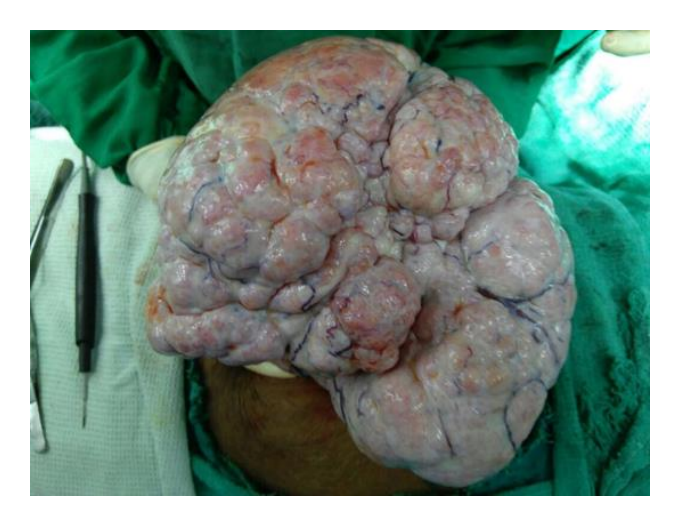
Figure 1: Large mass with bosselated surface weighing 9 Kg.

Features suggestive of leiomyosarcoma / Mullerian malignancy. CECT chest – normal study. Her CA 125 was 39.5U/mL. Under general anaesthesia patient in supine abdomen opened by midline transverse incision, huge mass of weight 9 kg excised (Figure 1), mass found to be arising from left uterine cornual end feeding vessel for the mass was left uterine artery. About 50 ml of ascitic fluid let out. Hysterectomy, salphingo oophorectomy with omentectomy done. Wound closed in layers with perfect hemostasis.