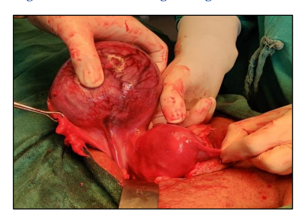
Figure 3: broad ligament sac showing foetus.

On laparotomy, a tense cystic mass of 8×7 cm, with increased vascularity was present between fallopian tube anteriorly and ovarian ligament posteriorly, i.e. in broad ligament. Mass was removed along with right sided salpingo-oophrectomy. Left sided adnexa was healthy and left sided tubectomy done. Mass was dissected, foetus along with placenta and amniotic fluid extracted. Patient had uneventful post-operative period and discharged successfully.