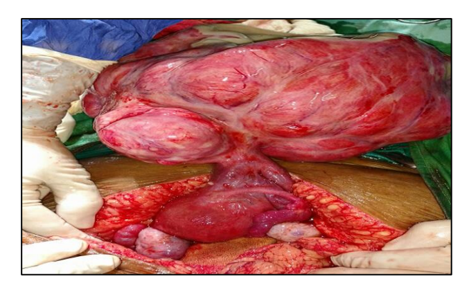
Figure 1: Origin of mass, thickened round ligament. Both the ovaries and tubes are healthy and separate from mass.

menstrual complaints. She had no history of bowel or bladder complaints. There was no history of weight loss, anorexia, or fever.