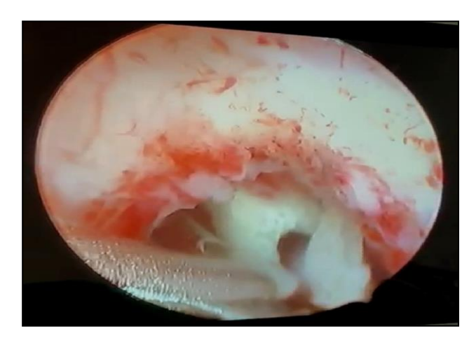
Figure 1: Hysteroscopic view of retained intrauterine fetal bones.

showed features s/o? Tubercular endometritis as endometrium is hyperechoic. She was subjected to diagnostic hysterolaparoscopy. Hysteroscopy showed presence of multiple retained fetal bones (Figure 1) with trabeculae, embedded in the endometrium (Figure 2).