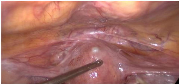
Figure 3: Laparoscopic Image showing the weak spot in the anterior wall.