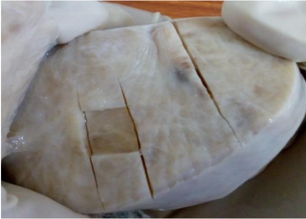
Figure 1: Cut section of ovarian fibroid showing greyish white whorled areas.

visualized concluding possibility of pedunculated myoma uterus or solid left ovarian mass; she undergone laprotomy.