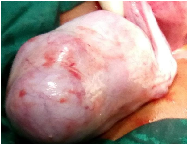
Figure 2: Intra-operative picture of ovarian mass.