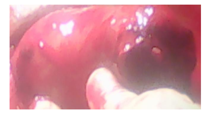
Figure 9: Bicornuate uterus with rupture of the right hemi-uterus.

Emergency laparotomy indicated for ruptured ectopic pregnancy complicated by clinical anemia. However, when opening the abdomen, a bicornuate uterus was discovered with rupture of the right hemi-uterus (Figure 9). The fetus had died intra-abdominally, the sex of which was difficult to determine. There is also a hemoperitoneum estimated at 600 ml. The operative consequences were simple. Check-ups for associated malformations were normal.