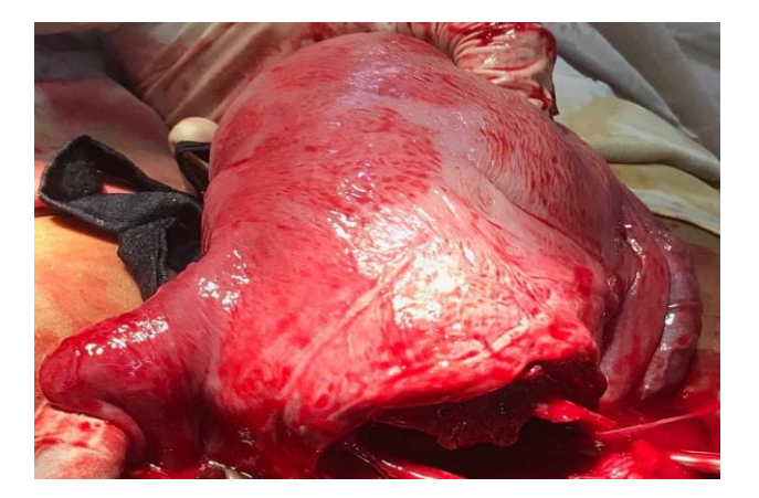
Figure 5: Pseudo-horn uterus with a rudimentary communicating horn after fetal extraction.

This is a 35-year-old woman, fourth gesture, two live children delivered vaginally. In her history, we noted a late spontaneous miscarriage at 17 weeks of amenorrhea and an appendectomy in 2002. She was referred to our center by a level I maternity unit for failure of induction at 42 weeks of amenorrhea and 2 days. The obstetric examination at the entrance revealed a uterine height of 36 cm, a cedematous, posterior, soft cervix dilated to 2 cm and the rest of the examination unremarkable. The fetal heart rate recording revealed severe fetal tachycardia at 194 beats per minute. An emergency Caesarean section is indicated to extract a baby of a male born asphyxiated, Apgar at 5 in the first minute, 7 in the fifth minute and 8 in the tenth minute and weighing 3500 g. And during this cesarean section we noticed the presence of a rudimentary communicating horn on a pseudo-horn uterus (Figure 5). The operative consequences were simple. The results of the associated malformations were normal.