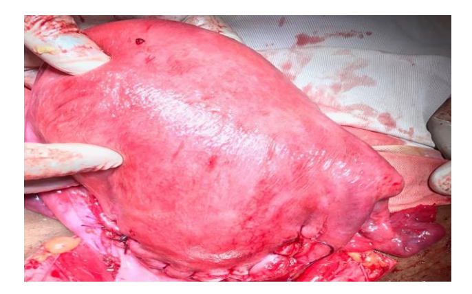
Figure 6: Partitioned uterus.

It is a 26-year-old woman, primigest with no particular history. She was admitted to the emergency room for ten hours of water loss at 37 weeks of amenorrhea and 3 days. Obstetric examination at entry showed uterine height of 30cm, speculum examination confirmed meconium loss; and vaginal examination objectified soft cervix, centered dilated to 4 cm and a fetus in breech presentation. We objectified a fever of 39.5° C associated with a fetal tachycardia of 185 beats per minute. The rest of the exam was unremarkable. An emergency Caesarean section indicated for onset of chorioamnionitis resulted in the removal of a male baby, born asphyxiated; Apgar 7 to M1, 8 and 10 to M5 and M10 and 2440 g. The uterus was partitioned at its upper two-thirds (Figure 6). The operative consequences were simple. Checkups looking for associated malformations are not done because the patient did not have the necessary financial means.