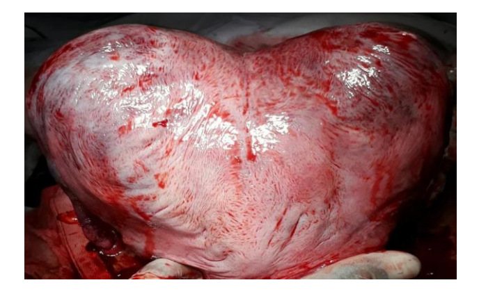
Figure 2: Didelphic uterus after fetal extraction.

Cesarean section is indicated as an emergency to extract a female baby with hydrocephalus, who died in utero in a remnant of meconium amniotic fluid, weighing 2500 g. On exteriorization of the uterus for hysterography, we found a bicornuate uterus (Figure 2). Checkups looking for associated urinary tract malformations are not done because the patient did not have the necessary financial means.