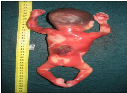
Figure 4: Myelomeningocele.

Chawdhary et al. The success rate 94% misoprostol and mifepristone and 86% misoprostol alone. 17