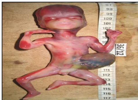
Figure 6: 35mm Omphalocele (liver, intestine, spleen).