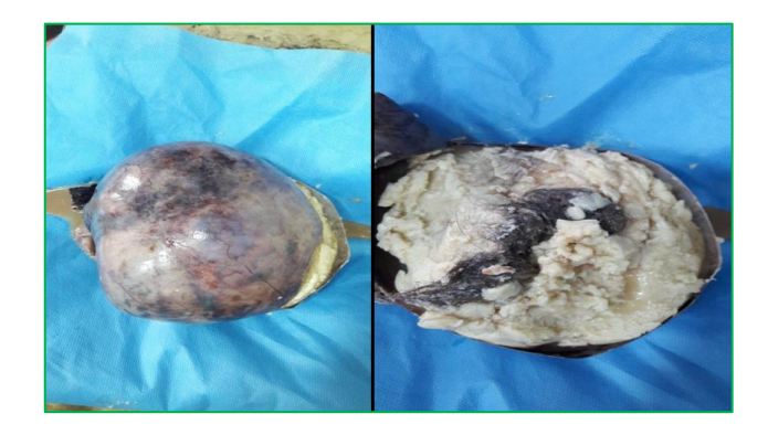
Figure 2: Dermoid cyst of 15x15 cm; cut specimen revealed teeth, hair, and thick sebaceous material.

Histopathological examination revealed twisted dermoid cyst (Figure 2). On gross examination a right ovarian cyst of size 14x9x7 cm filled with grey white cheesy material along with few hairs. Cut section shows pultaceous material with hair, inner surface of ovary shows hemorrhagic areas and tooth also identified.