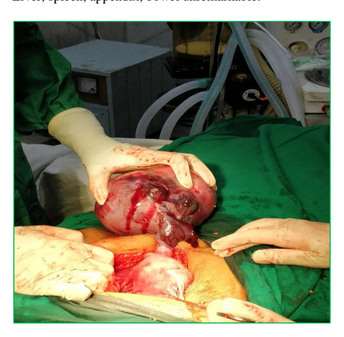
Figure 1: Dermoid cyst of right ovary on laparotomy.

Abdominal ultrasonography revealed the presence of large mixed echogenic solid, cystic and fat components within the lesion measuring 12.9x12.8x10.1 cm with thin echogenic septum and calcification in right ovary. The fat fluid level noted which moves on lateral decubitus position. Left ovary normal in size and echo pattern. Liver, spleen, appendix, bowel unremarkable.