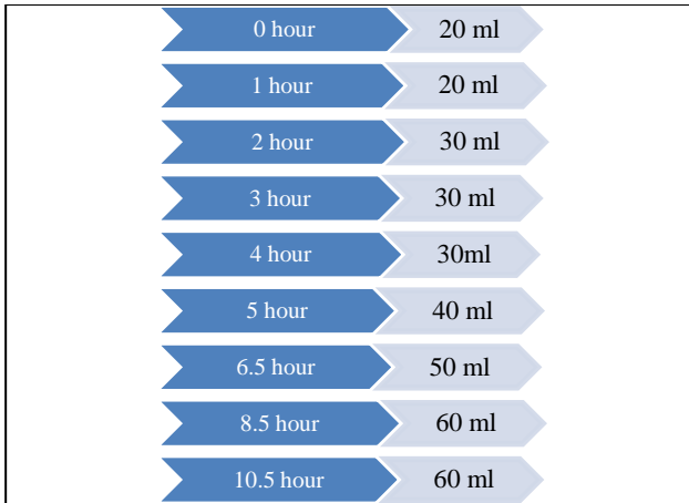
Figure 1: Dosage regimen of misoprostol.

Static OMS group: In group B, the recommended FIGO regimen was used. Oral misoprostol solution 25 µg (25 ml) was administered every 2 hours for a maximum of 12 doses or until the onset of regular uterine activity.