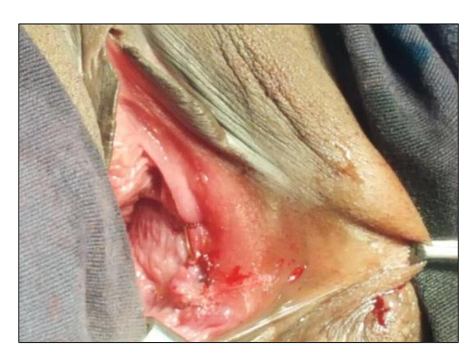
Figure 1: Sutures in situ amidst friable tissue.

Examination of the perineum revealed sutures in-situ along the left vaginal wall that were ineffectively holding together friable tissue which bled easily on touch (Figure 1). The sutured tissue was hyperemic, mildly edematous, mildly tender on manipulation and did not show any purulent material. The vestibule was otherwise normal.