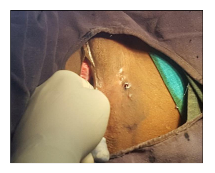
Figure 2: External opening.

Ipsilateral regional lymph nodes were enlarged, discrete and non-tender. Manipulation of the surrounding tissue led to mild bleeding from the internal opening, but no frank discharge of pus was noted, however, swabs were taken for microbiological studies. The rest of the clinical examination was unremarkable. Routine pre-operative investigations done were normal.