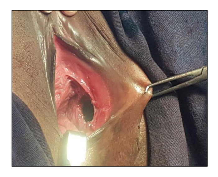
Figure 3: Post-track excision (vaginal aspect).

Dye installation was performed intra-operatively to delineate the fistulous track, which was then excised under spinal anesthesia (Figures 3 and 4), with achievement of healthy margins.