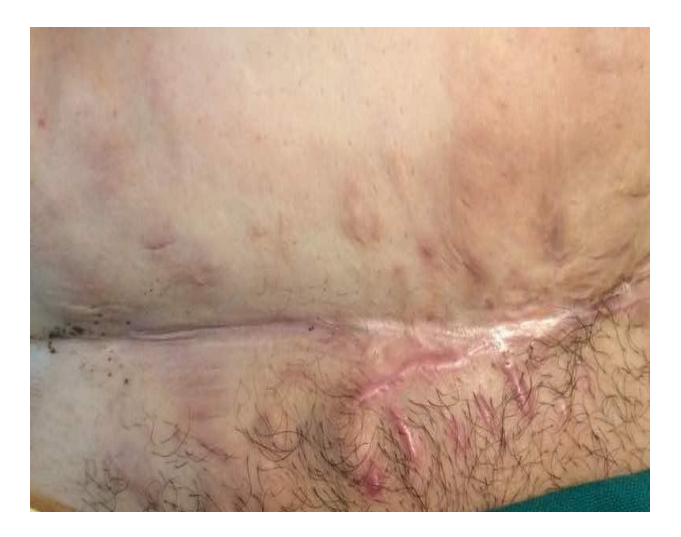
Figure 4: Post-operative healed surgical scar.

menstruation. After all pre-operative preparations, patient was posted for surgical excision of the lesion. Around 1 cm of healthy surrounding tissue was also removed (Figure 3) and sent for histopathological examination, which confirmed the diagnosis of scar endometriosis.