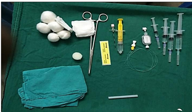
Figure 1: Requirements for epidural analgesic technique.

The procedure was explained to the patient. An 18 G cannula started and all patient were preloaded with 500 ml of Ringer lactate. Patient is positioned in either sitting or lying on her side with her knees and hips flexed (Figure 1).