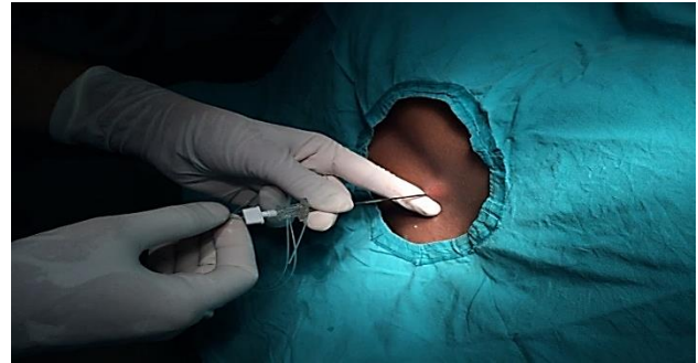
Figure 3: epidural analgesic technique.

The dose is given once the patient is in established labour. After the dose was given, the level of blockade was assessed by pin-prick technique and the upper level of sensory blockade was maintained at T10 level. 5