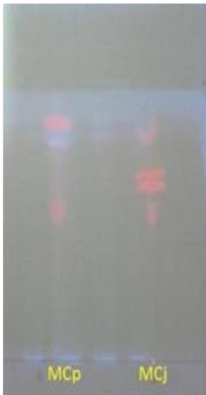
Figure 1: Thin layer chromatography of MCp and MCj.