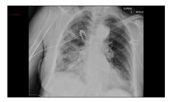
Figure 1: Chest X-ray showing predominant right middle and lower zone consolidation, and also some left basal consolidation (before antibiotic treatment).

A resting 12 lead electrocardiogram (ECG) was unremarkable. The initial plain chest radiograph confirmed predominant right middle and lower zone consolidation suggestive of a pneumonia (Figure 1).