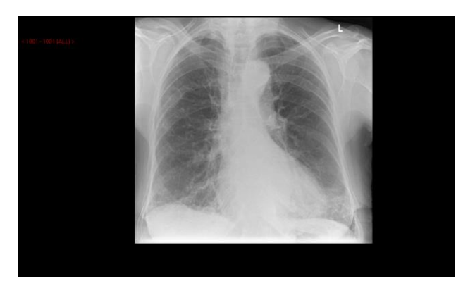
Figure 2: Chest X-ray showing improvement to right middle and lower zone consolidation, and also to the left basal consolidation (after antibiotic treatment).

The working diagnoses included a fall with a long lie, hypoactive delirium, right-side predominant aspiration