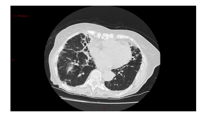
Figure 4: Section of HRCT scan showing further changes of pulmonary fibrosis with septal thickening.

and middle lobes and lingula which were likely part of the fibrotic process, but superadded infection was raised as a possibility. There was no pleural effusion but a shallow pericardial effusion was noted. Marked coronary artery calcification was noted. There were no size significant thoracic lymph nodes. There were old bilateral rib fractures but no destructive bone lesion. The summary opinion was: CT confirms pulmonary fibrosis with honeycombing and traction bronchiectasis. Overall appearances would be consistent with nitrofurantoin associated fibrosis.