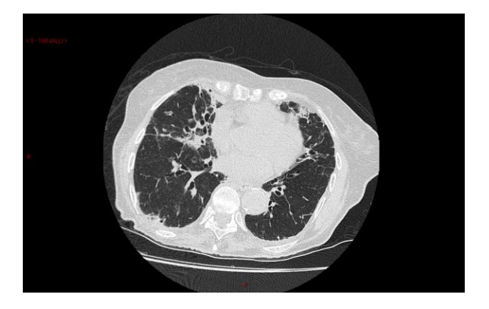
Figure 3: Section of HRCT scan showing background changes of pulmonary fibrosis.

A high-resolution non-contrast computerised tomography (HRCT) lung scan (Figures 3-5) demonstrated evidence of mild-moderate pulmonary fibrosis with septal thickening, scattered ground-glass opacity and honeycombing, with a mostly peripheral distribution.