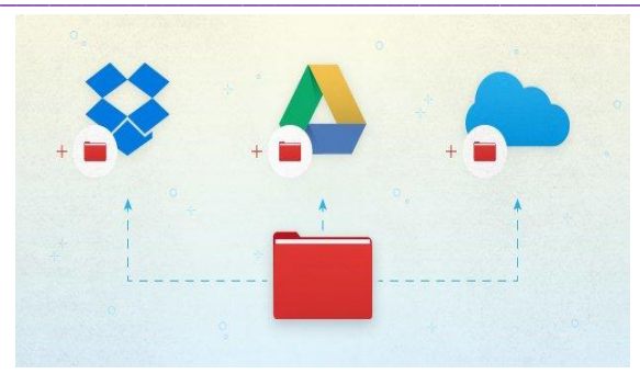
Figure 7.1: Back up process

ii. Update antivirus: A proper antivirus is essential for the prevention of any virus and malware. A free antivirus named AVG antivirus does a lot of malware prevention. Another software named AVG Internet Security that gives protection for the system from ransomwares, and blocks applications that modify the user files and that are suspicious. There is a security solution called InterScan Web Security that do not allow ransomware to reach the user system through emails and web pages. Trend Micro Security 10 also provides protection for the user data by blocking various malwares attacking through malicious websites and various threats associated with these sites.