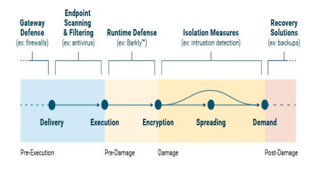
Figure 7.2 : Stages of attacks

Iv. Browser must be clean: Adware invasions must be prevented by avoiding add-ons and junk toolbars. The stages of attacks and corresponding security solution are shown in figure 7.2.