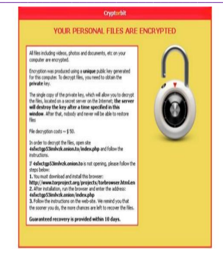
Figure 2.1 : Encryption page view

Encrypting ransomware: Encryption is the process where various important files and documents are altered by the ransomware making the user unable to use those specific data and demanding a particular amount to provide the user with decryption key. A scheduled time will be given to user saying if not paid in that deadline key required to decrypt the data would be deleted. All the potential vulnerabilities are exploited for encryption. All the business information and personal files can be encrypted[4]. Files are deleted and payment note along with instructions to the payment is generally placed in the same folder. The victim cannot access that files which are encrypted but can use various other windows unlike lockscreenransomware. Encryption page looks similar as shown in figure 2.1.