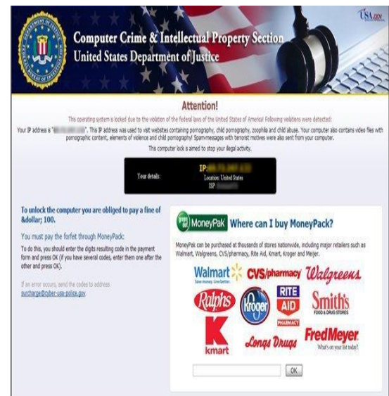
Figure 4 : Fraud law page view

In 2012, raveton began to spread by a major ransomware Trojan. This displays a fake and severe warning saying that a notice from law agency and states that the system was used for criminal and illegal activities like using or downloading. It further indicates that private software or any unlicensed software is in use and performing activities such as encouraging terrorism and child pornography. The user is then asked to pay the specific fee to unlock the system thinking it is from the real law agency, the user pays the specific amount with fear to get the system unlocked. Since the criminals pretend as law enforcement agency and lock system they generally ask only prepaid vouchers. To increase the illusion the user that it is really from the law agency the ip address of the system will be hacked and displayed and footages. The pictures and logos of the law are presented on the screen to make the victim believe. Password stealing makware is also distributed by raveton in 2014. The fraud law page from police looks as shown in figure 4.