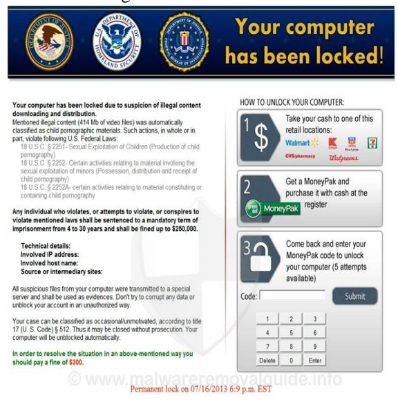
Figure 2 : Lockscreen Page view

Lockscreenransomware : When an individual view a site and the system issue a notification to confirm regarding any action then all of a sudden the victim screen will be locked and the screen is completely seized and receives a message or notice stating that the screen is locked and a particular amount is to be paid to unlock the screen[3]. This compels in user inability in moving further. User has no other option except to pay the amount as the complete operating system will be locked. Notice is present on the complete screen blocking all other windows. Here, only the screen will be blocked but the files are not encrypted. Lockscreen page looks as shown in figure 2.