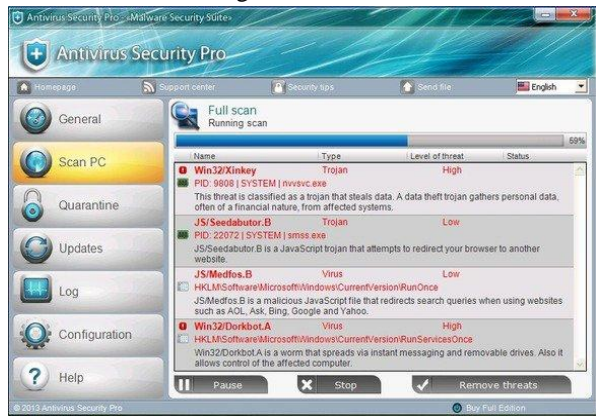
Figure 2.3: Scareware page

ransomware to be removed. Scareware page consists of all fake tools as shown in figure 2.3.