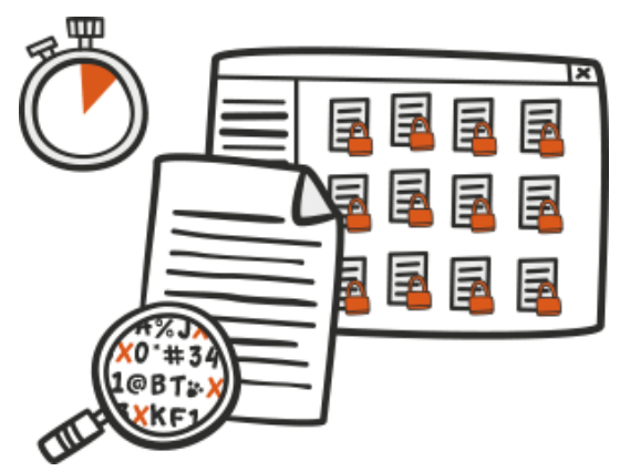
Figure 1: Ransomware attacks stages

Simply, ransomware attacks can be viewed in three stages first is delivery, through various methods ransomware is transmitted. Second is execution where all the files and security issues are studied and decides which data and what extension files to be handled. Third is encryption, this encryption takes place in minutes and sometimes even in seconds chimera ransomware just requires 18 seconds to encrypt the data. Encryption will be done as shown in figure 1. Once the ransomware attacks it uses various complex algorithm to encrypt the data various algorithms such as RSA and RC4 etc.