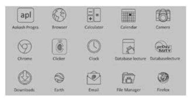
Fig. 2. Sample page of applications

The tablet comes with variety of applications. A sample set of applications is shown below.