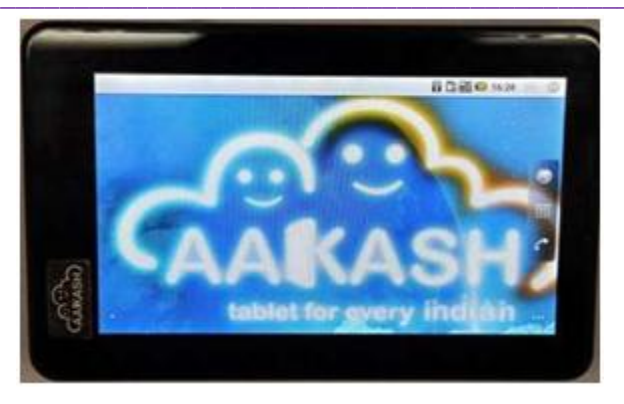
Fig. 1. Aakash 2.0 tablet