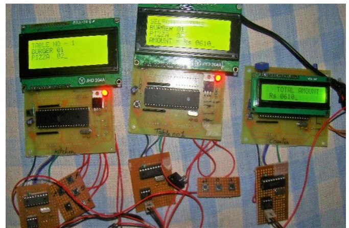
Figure3: Customer Section

The CAN communication protocol is CSMA/CD (carrier sense multiple access). In this protocol, every node on the network must monitor the bus for period of time. In this period of no activity occurs, every node on the bus has an equal oppotunity to transmit a messge (Multiple Access).