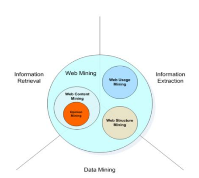
Figure 1: web mining [3]

mining applications. Exploring better these techniques is extremely necessary to cope with the amount of available data in the Information Overload Era. Also, with the Web being increasingly oriented towards the importance of semantics and integration of information, these areas of study become very important to address the new future trends of the Web.