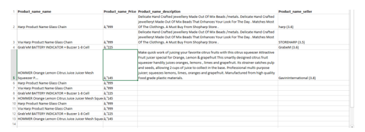
Figure 5: Data Set after scraping online scraping tool

After this we study for the free available scraping tool 'ParseHub'. It a simply point and click software base on a standard API. User have full controle on extraction of data from targeted website. It work like a hierarchical base selection of data. At the starting of scraping, user simply select the field which he/she want to extract, then ParseHub automatically guess similar data element from a website. As user select a related information which he want to extract al similar element are extracted. For selecting a other data elements from a targeted website a 'relative' search option is available which is subset information about previously select element. Likewise user extract all information from website. At the time of extraction of element from a website, ParseHub provide a URL also. This URL is optional field. After successful web scraping data sets are saved in a CVS format as shown following.