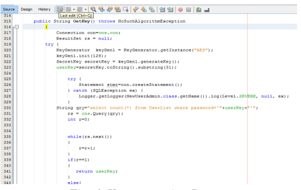
Fig. 4. Key generation Process

In above snapshot authorization process is successfully completed. If any unauthorized person will try to login or upload data, then cloud service provider will check this using a secret key and then they add unauthorized person into fraud list.