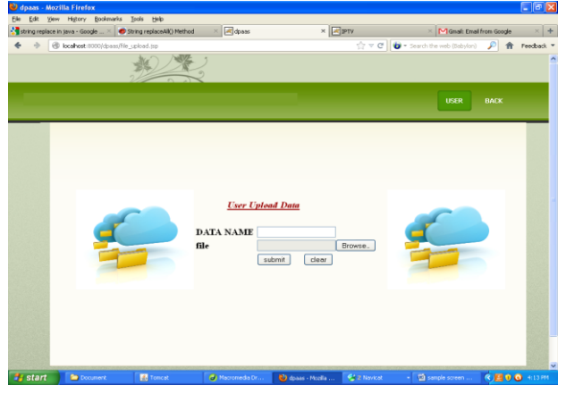
Fig. 3. Successful Authentication

The above mentioned algorithm is implemented on CloudSim framework. CloudSim [12] is a simulation toolkit which comprises of various predefined classes that provide a simulation environment for Cloud computing. It is a java based simulation toolkit and can be implemented either using Eclipse or Net Beans IDE. In our case we would be using the Net Beans IDE. To run CloudSim on Net Beans, we first need to download the Net Beans IDE and install it. After successful installation of eclipse IDE, download the latest CloudSim package, extract it and import it in Net Beans. Talking of our proposed work we have created our own classes in CloudSim and have portrayed our algorithm in form of java code. The following are the screenshots that depict the working of our algorithm on CloudSim framework.