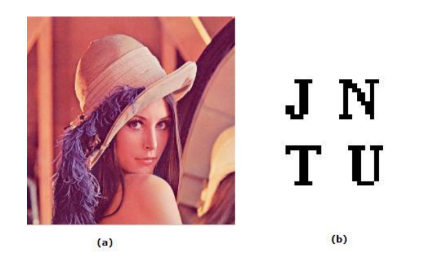
Figure 3. (a) Cover Image Lena; (b) watermark

The algorithm is implemented using MATLAB R2013b.