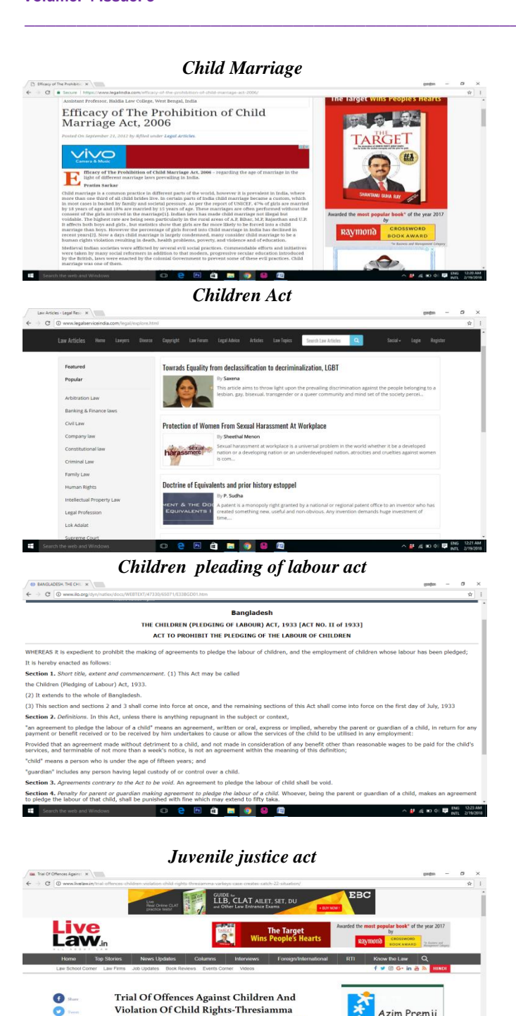
Children and young persons act

Varkey's Case Creates A Catch-22 Situation