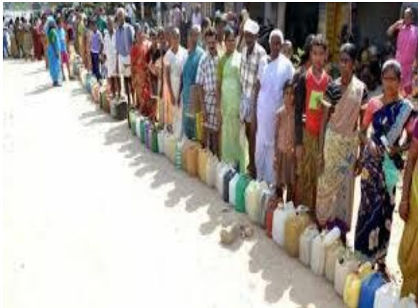
Fig.3.2. This is the condition of outside the ration shop.