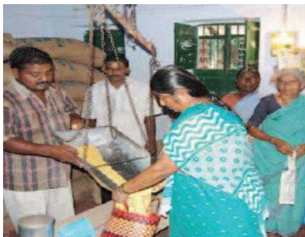
Fig.3.3. This is the condition inside the ration shop.