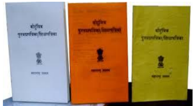
Fig.3.4. Ration Cards.