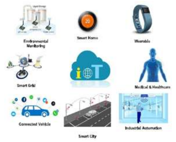
Fig. 1. IoT applications.

As the IoT manufacturers failed to implement a robust secu-rity system in the devices, sanctuary experts have warned the potential risk of large numbers of unsecured devices connect-ing to the Internet [3]. In December of 2013, a researcher at Proof point, an enterprise sanctuary firm, discovered the first IoT botnet. According to Proof point, more than 25% of the bot-net was made up of devices other than computers, including smart TVs, baby monitors, and other household appliances. Recently, Dyn, Manchester, New Hampshire-