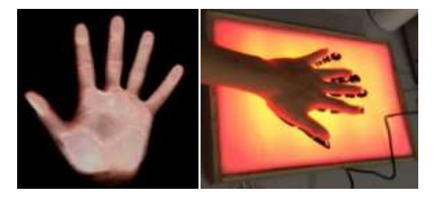
Figure 3: Captured image of palmprint and scanning device

In past few years the main focus of research is on offline palmprint identification. This is because the resolution of offline palmprint images is high (up to 500 dpi), so it contains a large information that can be used for identification. Identification techniques that applied to fingerprint images can be useful for offline palmprint identification, where datum points, lines and singular points can be extracted. For on-line palmprint authentication, the samples are directly obtained by a palmprint scanner . Figure 3 shows a captured palmprint image by a scanner and scanning device .