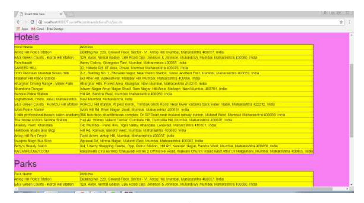
Fig2:Point of interest.

In Fig. 1 Shortest path will gives the shortest path from one place to another, from starting point to destination point it will suggest from which location your destination will be shortest to travel.