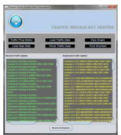
Traffic Broadcast Server