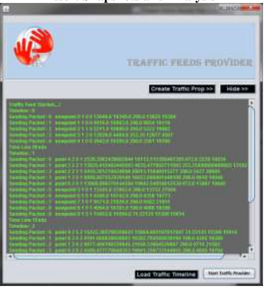
Fig. Traffic Feed Provider