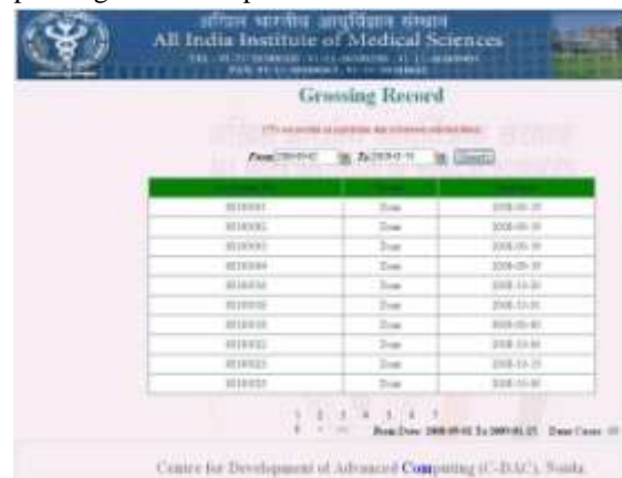
Fig.4. Viewing the record of a particular lab in customized CARE2X

This module will show you the complete work record of a particular lab including details about completed cases and pending cases on a particular date or between two dates.