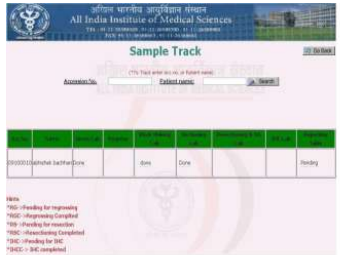
Fig.3. sample tracking in customized CARE2X

The functionality of this module is to track status of a sample by patient name or by accession key. It will show the complete detail about that sample i.e. in which lab sample is pending and which lab has been completed (on which date).