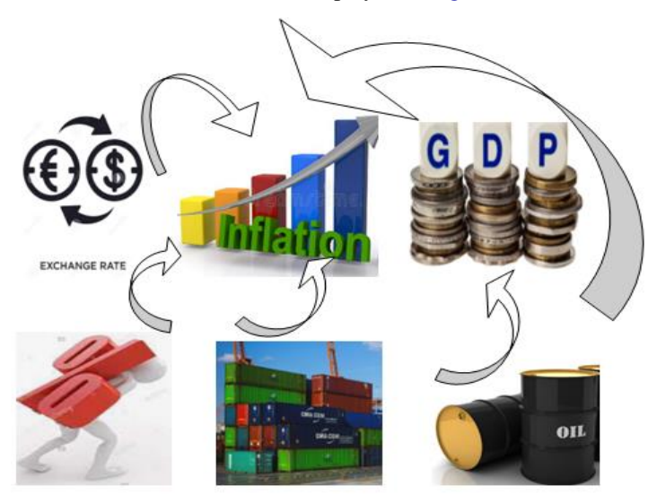
Figure no. 3 - Modified PC algorithm using modified R residuals

We applied modified PC algorithm of GTA to determine the significant causal directions between monetary policy and inflation by talking both monetary and non-monetary channels as discussed earlier. Modified PC algorithm treat modified R residuals as original variables in TETRAD 4.9.1 software and the results are displayed in Figure no. 3 as under.