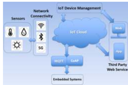
Figure 2 : Implementation of IoT architecture

These components are the building blocks of IoT, here is another representation in the form of equation [1,19]: