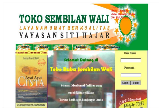
Figure 1. View Home Page