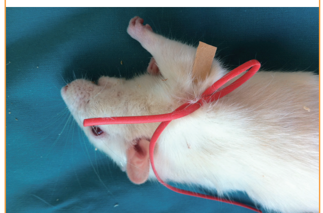
Fig. 1. Creating ischemia in the gracilis muscle flap

Thirty rats were randomly assigned to 5 groups (6 animals per group). In group 1, no surgery was performed, and only blood samples were taken. In group 2 (control), the vessels were clamped to induce 4 hours of ischemia and then opened for 48 hours of reperfusion. In group 3 (remote ischemic preconditioning, RIPreC), 3 cycles of 5-minute I/R were performed before 4 hours of ischemia. In group 4 (remote ischemic postconditioning, RIPostC), 3 cycles of 5-minute I/R were performed after 4 hours of ischemia. In group 5 (remote ischemic preconditioning, RIPerC), 3 cycles of 5-minute I/R were performed after flap elevation, during 4 hours of ischemia (Table 1).