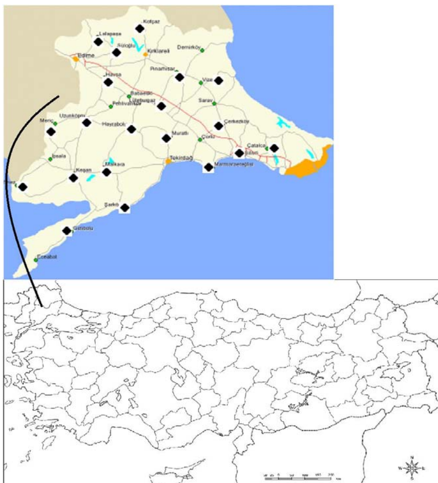
Figure 2.1. The map of locations in Thrace region of Turkey

The locations were determined based on differences in geographical structures with variable ecological conditions (Figure 2.1.). Plant samples were taken from 20 different points from areas away from residential areas (two in İstanbul, six in Tekirdağ, four in Kırklareli, seven in Edirne and one in Çanakkale) on 6-7 May 2013. The collection days had clear and sunny weather, the temperatures ranged between 17.2°C to 21.5°C. The altitudes of sampling locations varied from 6 - 518 m (Table 2.1).