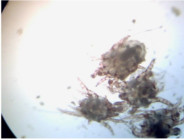
Figure 1. Adult O. cynotis mites and female with a visible egg.

on severity (0: absent, 1: mild, 2: moderate, and 3: severe) as reported previously (22–24).