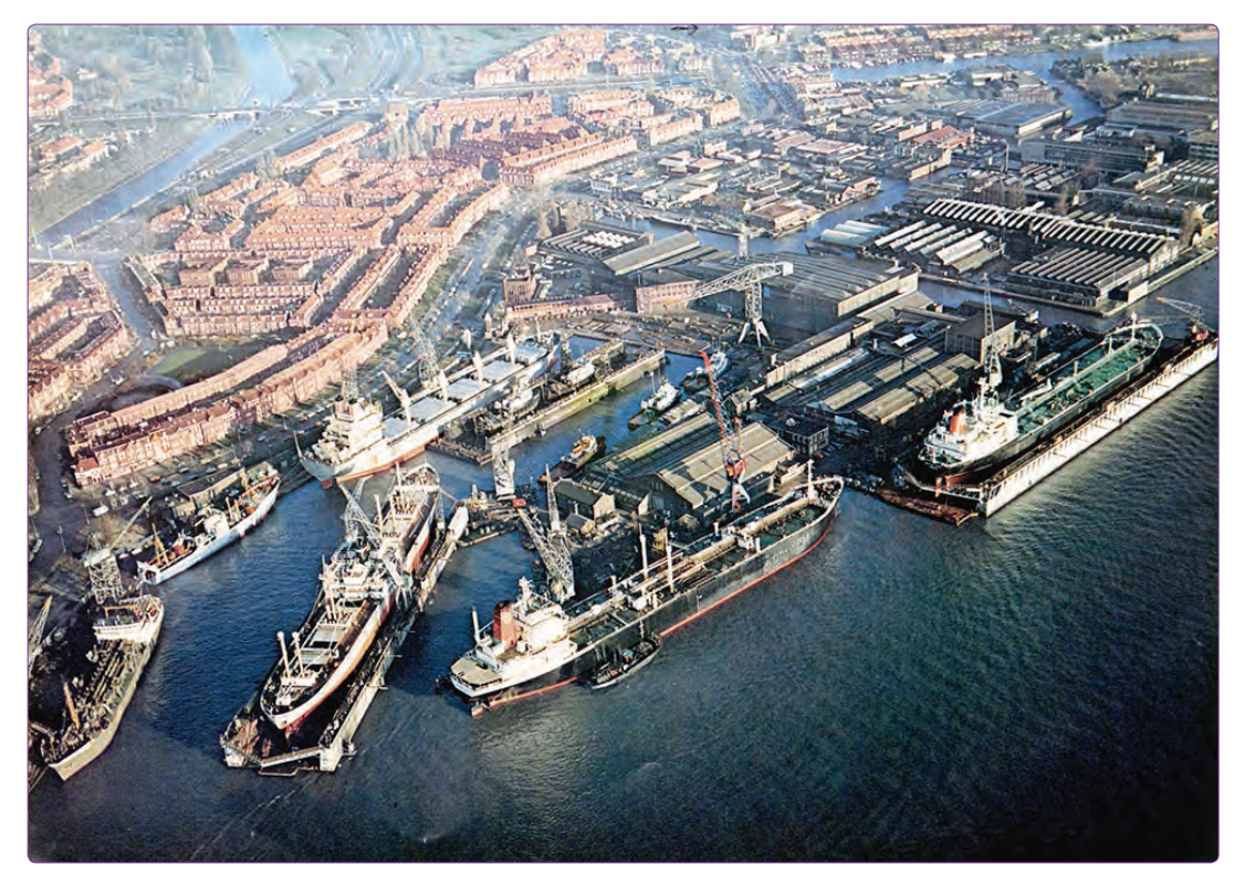
Figure 4. Historical Development IJ-plein, 1976 (http://www.ndsm-werfmuseum.nl/de-werven/adm).