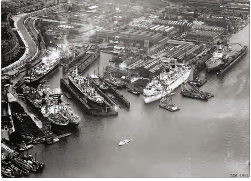
Figure 2. Historical Development IJ-plein, 1951 (http://www.ndsm-werfmuseum.nl/dewerven/adm).