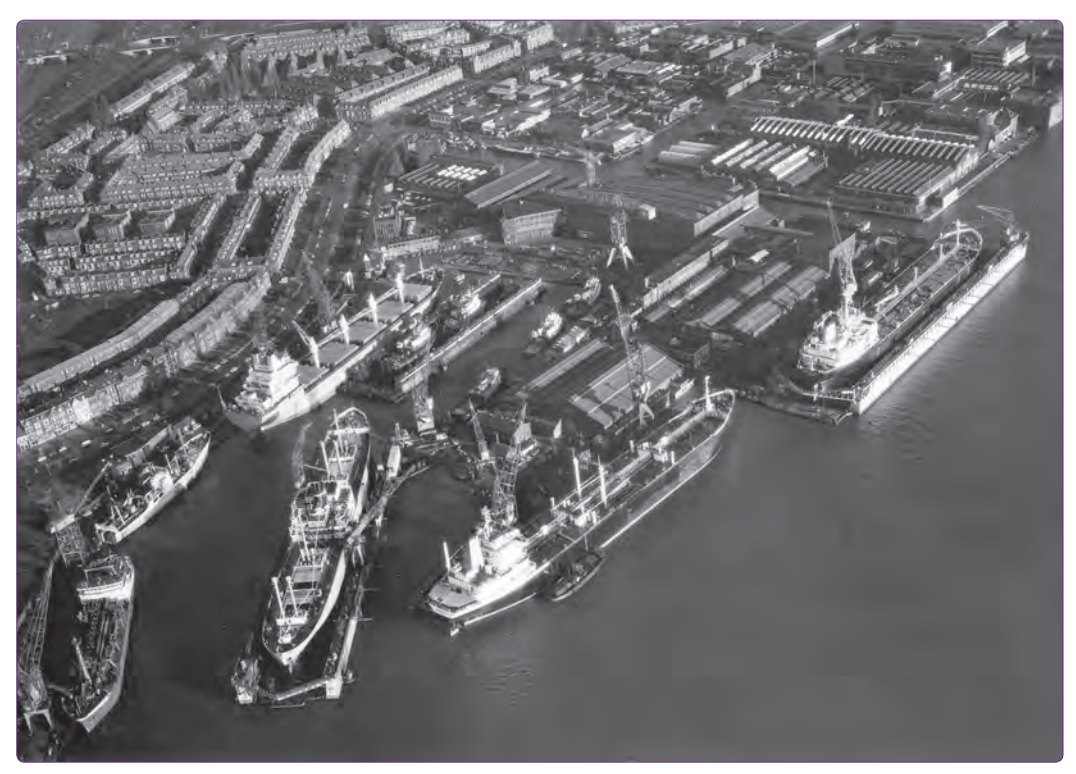
Figure 5. Historical Development IJ-plein, 1977 (http://www.ndsm-werfmuseum.nl/de-werven/adm).