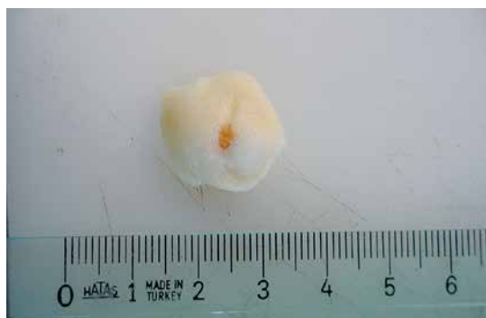
Figure 3. The wound excised with surrounding tissue and photographed for area measurement

four groups (Table II); however, angiogenesis was higher in all treatment groups compared to the control group, although the difference was not statistically significant ( p = 0.65 ).