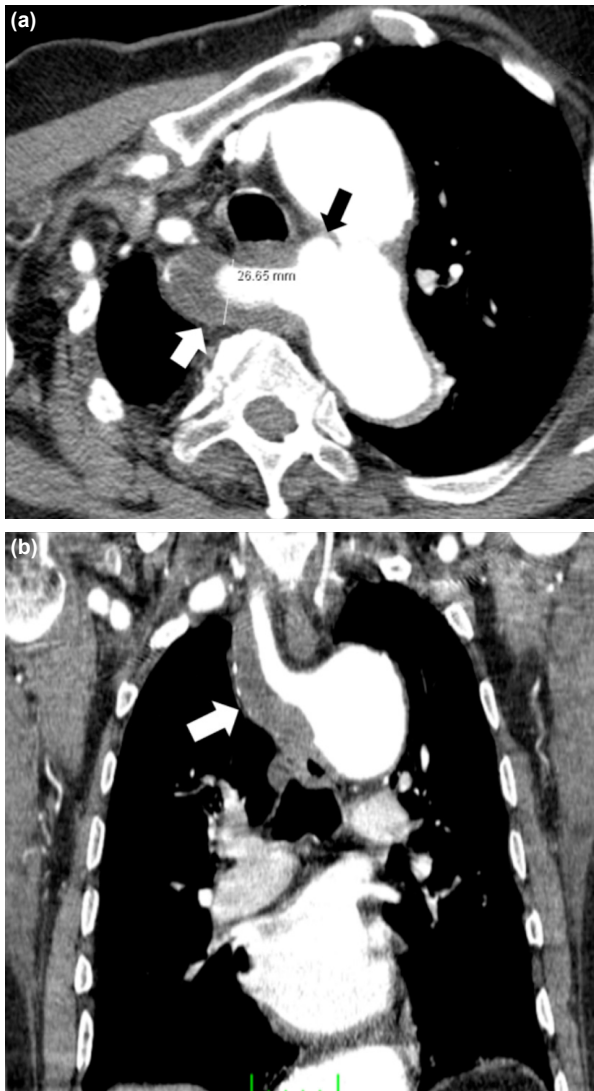
Figure 1. (a) Axial oblique contrast-enhanced computed tomography image of the first patient depicts the aberrant right subclavian artery (white arrow) associated with a Kommerell diverticulum (black arrow). The vessel calibration was increased and there was an intraluminal mural thrombus. (b) Coronal oblique reformatted contrast-enhanced computed tomography image shows the vessel's route and the mural thrombus (white arrow).

examination were within normal limits. His blood pressure was 140/90 mmHg. Echocardiography revealed dilatation of the thoracic aorta. A CECT of the thorax was performed in order to evaluate the aorta more thoroughly. This examination disclosed an aberrant vessel stemming from the distal medial wall of the aortic arch and traversing the trachea and the esophagus from the posterior aspect before extending toward the right upper extremity. The maximum diameter of the vessel was 32 mm, and there was a mural thrombus in the vessel, which did not cause any significant narrowing of the lumen. The findings were compatible with an ARSA aneurysm. No associated Kommerell diverticulum was present (Figures 2a and b).