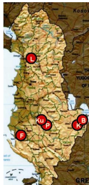
Figure.2. The dendrogramme of local rabbit subpopulations groups in their geographical regions.

Poshnje-Kutalli-Fier, Korçë-Devoll and Lezhë. Inside groups the distribution of individuals of rabbits was greater in Lezhë region. The differences between rabbits reared in Kutalli and Poshnje farms were not significant.