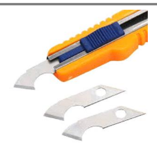
Figure 6: Acrylic Cutter [9].

Acrylic specialized cutter can be used for acrylic sheets of different thicknesses. Acrylic blades are bent and pointed to increase the pressure on the acrylic sheet to cut it easily. Instead of making the primary model to protect other models and keep it safe, acrylic covers can be cut and finished by the acrylic cutter.