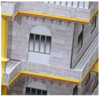
Figure 12: Material for Texture on the Wall