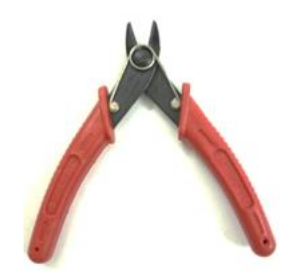
Figure 10: Wire Cutter

Hot wire cutter is used to cut thermocol and Foam board in different shapes and form. It is very useful to make history and monumental model.