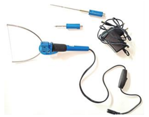
Figure 9: Circle/Compass Cutter

Circular Cutter (Hand Wheel Type) is a manually operated cutter with four knives along the perimeter. Circular and semicircular shapes can be cut with Circle/compass Cutter.