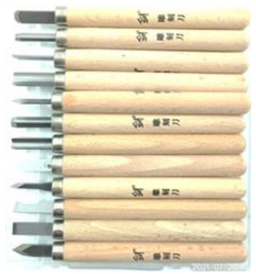
Figure 5: Wooden Knives

Basic knives are used to cut paper with precision. They are available in a wide choice of models, shapes & sizes. For detailed models to give proper finishing basic knives can be used to cut the materials like mount board and balsawood. To give a different edge finish, 10 blades have provided.