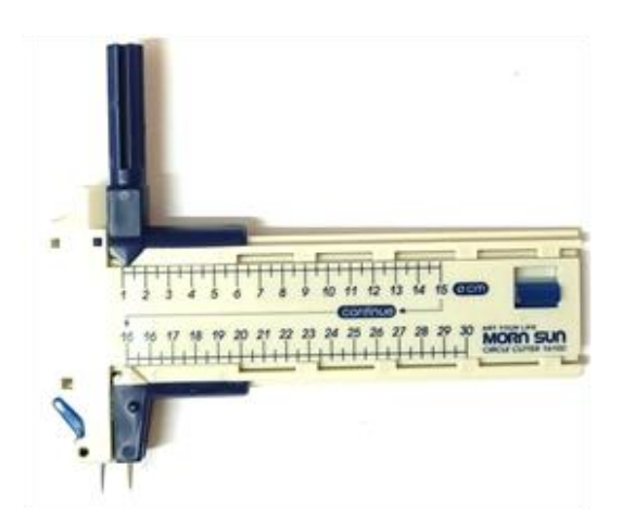
Figure 8: Circle/Compass Cutter [source: author]

Glass cutter is used to cut glass cover to display and protect the model and keep it safe. Diamond is fixed on the edge of the cutter to cut the glass in different shapes.