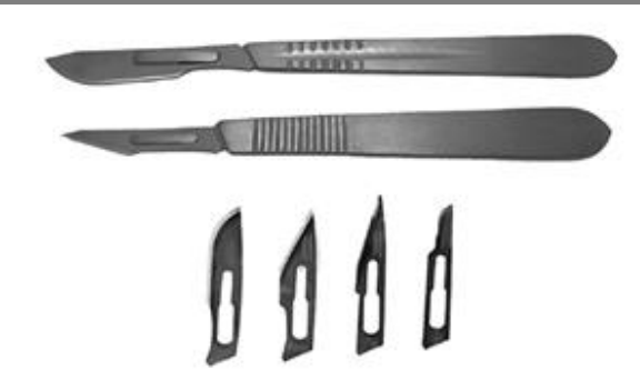
Figure 3: Scalpel

L-square can be helpful in fix model corners perpendicular. One side of L-square consist of measuring scale which can be used for measurement. Both plastics and steel scales are available of small and large sizes to work on different sizes of models.