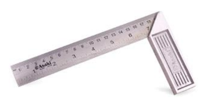
Figure 2: L-square [8].

To achieve proper finishing, model making tools play a major role. Selection of tools depends upon the type of materials used in the model and scale of the model. The amount of detailing required in the model also influences the selection of tools.