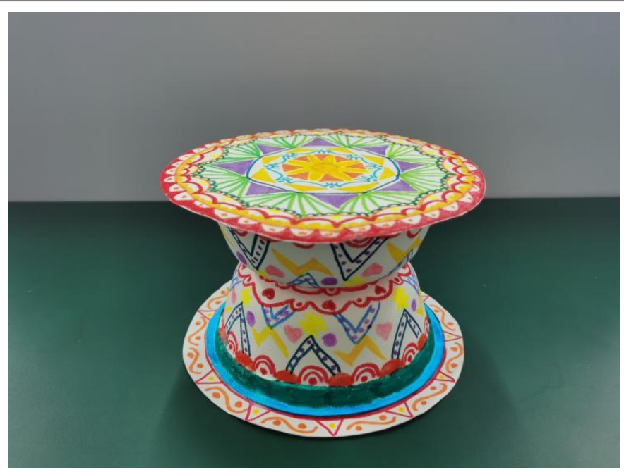
Figure 7: Paper plate embroidery ball

The paper plate embroidery ball (Fig. 7) is made by drawing the pattern of the copper drum symbol in a disposable paper plate with marker, either monochrome or colorful. 3 or 12 paper plates are assembled into the