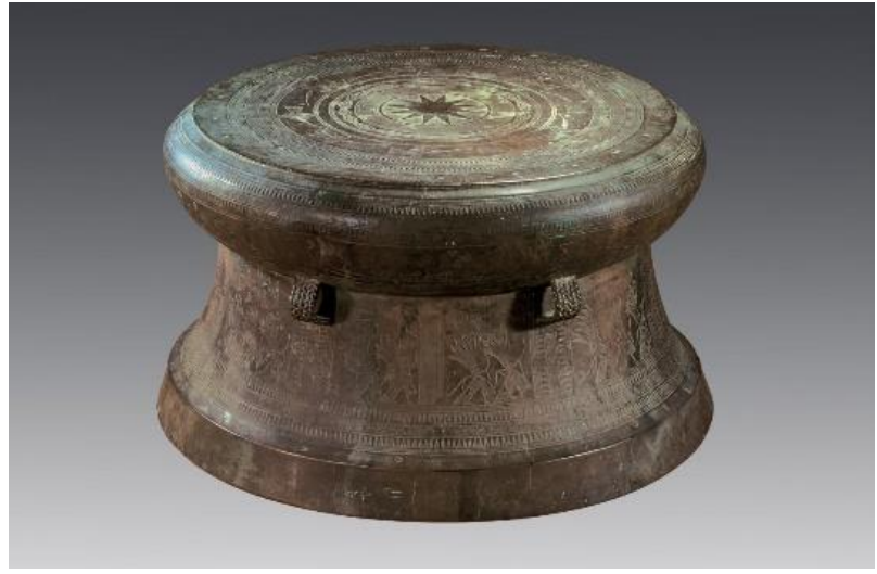
Figure 1: Copper drum

integration can, to a certain extent, enhance students' understanding of folk art in the region, not only make them realize the value of folk art in the region and arouse students' national pride, but also have great significance for the transmission of intangible cultural heritage (Zhang, 2014).