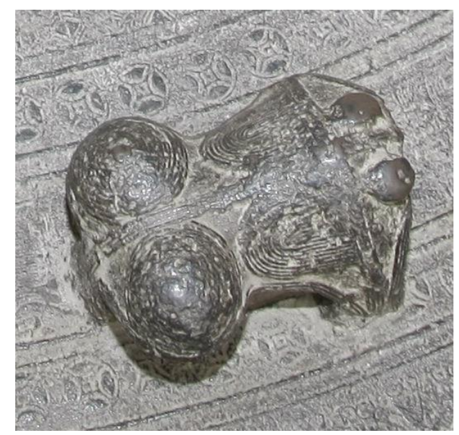
Figure 4: Copper drum frog pattern (image from the Internet)

The frogs (Fig. 4) are one of the most characteristic decorations and are carved in three-dimensional relief, with a common number of eight. Some of these frogs are facing the center of the drum, some are facing the center of the drum, and some are rotating in one