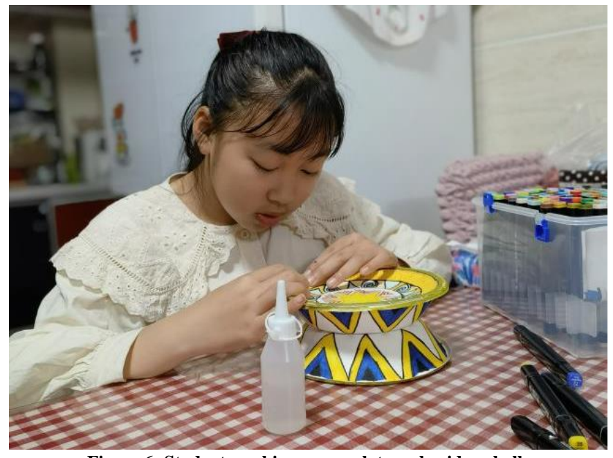
Figure 6: Students making paper plate embroidery balls

teaching, and pass on the traditional copper drum motif patterns in a subtle way (Pan, 2018). In order to better integrate the copper drum motif pattern into elementary school art education, traditional copper drum motif patterns can also be used in the production of handicrafts, especially children's play and teaching aids for elementary school art courses, such as paper plate embroidery balls, paper umbrella paintings, and puzzles.