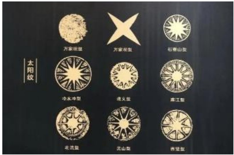
Figure 2: Copper drum sunburst

The copper drum pictorial decoration expresses their life scenes on the one hand, and their unique aesthetic sense on the other, which is rich in romance. The decorative patterns of copper drums include sun patterns, cloud and thunder patterns, feathered man patterns, athletic patterns, rowing boat patterns, swimming flag patterns, soaring vulture patterns, geometric patterns, etc. (Li, 2020).