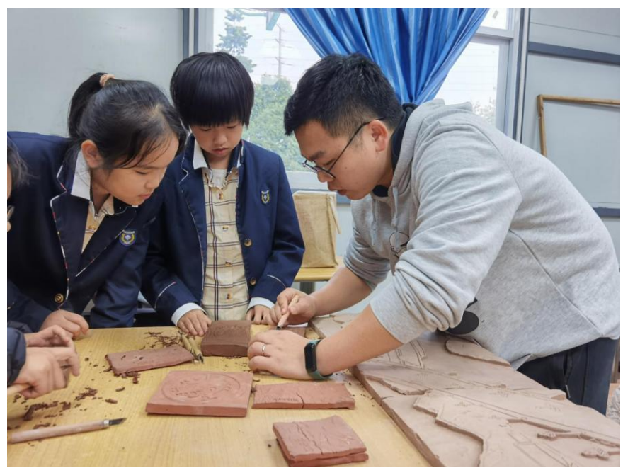
Figure 8: The author is teaching students to make copper drum pottery sculptures

shape of an embroidery ball, which can be made into a single rattle, or threaded with a string, like a string of lanterns, or decorated at the bottom with a thin string as a hanging beard.