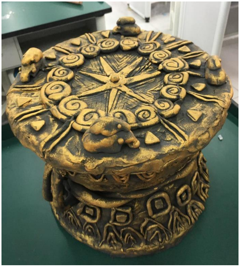
Figure 10: Copper drum in colored clay

Children's playthings are mostly purchased, etc., and lack puzzles rich in national cultural symbols (Li, Tan & Zhang, 2021). To this end, teachers can first connect the bottoms of two pots of the same size together with