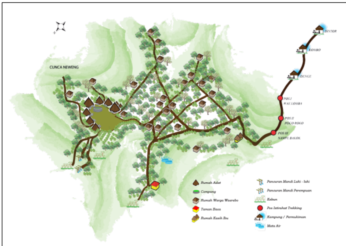
Figure 2. Map of Waerebo village as a result of joint planning with the community assisted by Indecon