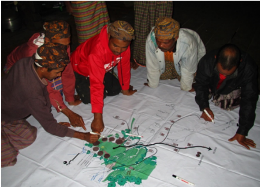
Figure 1. The planning process with the community through several stages

Spatial planning was another important activity in planning. It aimed to ensure the availability of sufficient and appropriate spaces for the designed tourism activities. In addition, it aimed to ensure that tourism activities do not interfere or coexist in harmony with people's daily lives.