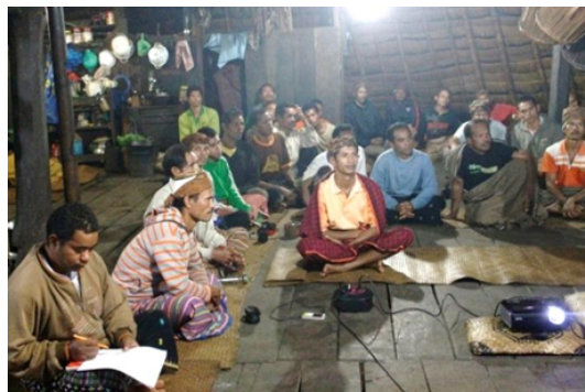
Figure 3. The process of increasing the capacity of tourism institutions by Indecon

The capacity building program for Waerebo community was based on the studies during the planning process and strategies developed by Indecon with the community. At the beginning of tourism development at Waerebo traditional village, capacity building was focused on institutional capacity, which included organizational training, bookkeeping and administration, communication channels, handling complaints and conflicts (see figure 3). Furthermore, when the management system had been mutually agreed upon, standard operational procedures were made and technical trainings were carried out to increase the capacity of the community who will be involved in their respective positions. The training improved capacity on hospitality services for daily managers at guest houses, guiding technique, porter service, meals preparation, room maintenance training, and cleaning the bathroom.