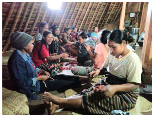
Figure 4. Training on handicrafts and packaging of food-based products