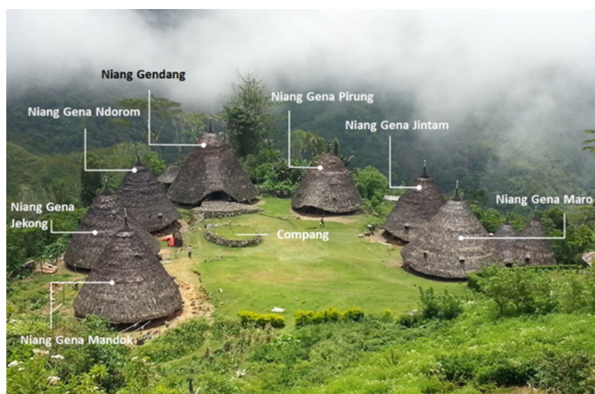
Figure 5. The beauty of Waerebo traditional village setting

Hilly rainforests, diversity of flora and fauna, landscapes with beautiful views, authentic culture and architecture, and friendly people are a complete combination for this destination. While the activity of traveling up the hills in the rainforest provides its own sensation for tourists. The beauty of Waerebo traditional village and its traditional houses or niang, is presented in Figure 5. The number of tourist visits continued to increase from year to year until 2019 (see Figure 6) before the COVID19 pandemic started. From March 16, 2020 to October 2021, Waerebo village was closed for tourist; then it was opened gradually by implementing health protocols.