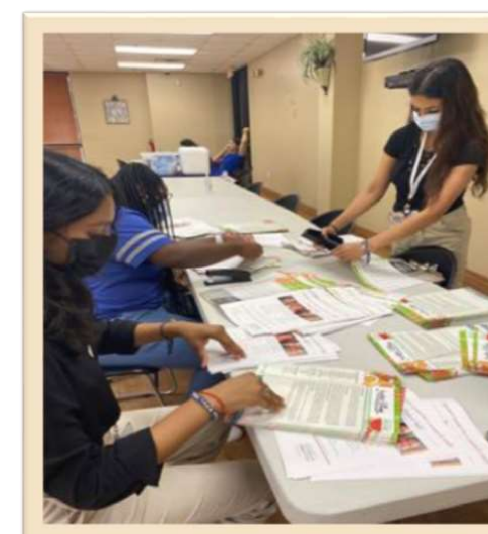
Picture: Summer Interns at Irvinton Village before a community event, stuffing newsletters (6/2022).