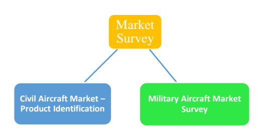
Fig. 4Market survey Classifications

The UK. A request for a product from the Ministry of Defence (MoD) to the National Infrastructure (RFP), where most of the product is privately operated, is made in the military. However, the lingo is different in the United States. The process of discovering new products is complicated. The Department of Defence (MoD) must maintain track of potential competitors' existing and future capabilities and manage the nation's research, design, and development (RD&D) infrastructure to stay ahead of the competition.