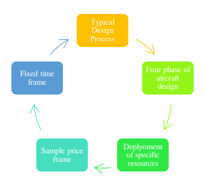
Fig. 1 Phase 1: Stage of conceptual study (feasibility study)

The particular time spans for several types of project phases. All values are estimates for the month. Throughout the year, research is conducted to determine the viability of incorporating new technologies and pushing the boundaries of the company's capabilities which is implied rather than explicit.